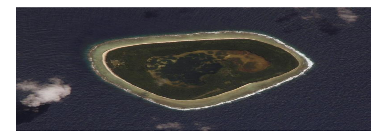
Image by ISS Expedition 15 crew - ISS015-E-19240, Public Domain, https://commons.wikimedia.org/w/index.php?curid=49305691